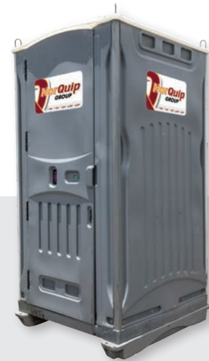
Event - Portable Toilets

Our fleet includes a range of event-style portable toilets. These toilets are kept exclusively for events and functions and always presented to the highest possible standard.