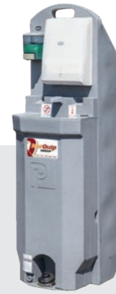
Hand Wash Stations On Wheels

An alternative hand wash solution that also provides soap, water and paper towel but with added mobility.