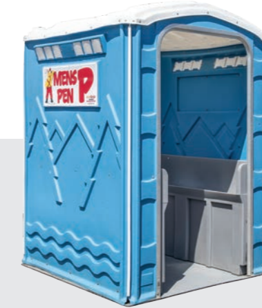
Portable Urinals & Walkthrough P Pens

Ideal for large sporting events, parties or functions. Portable Urinals increase the flow-through of male patrons, easing the burden on other amenities. Walkthrough or panel style are supplied with privacy screening.