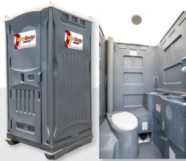
Deluxe - Portable Toilets

Our deluxe-style portable toilets include LED solar sensor lighting, stocked hand soap and paper towel dispensers, and a bin for disposal of the paper towel.