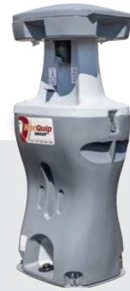
Hand Wash Stations Two Person

Provides an upright hand wash solution with liquid soap, water and paper towel so your guests can be assured they have washed properly.