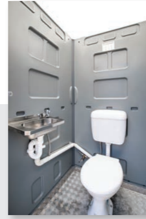
Sewer Connect Toilets

Most suitable for long-term use on sites with sewer and mains water supply readily available. Modern solid plastic construction ventilated for maximum user comfort.