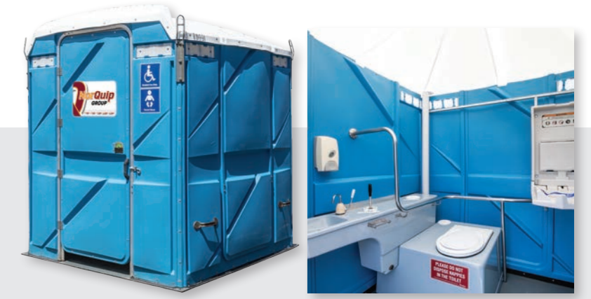
Portable Disability Toilets

Our fully compliant Disability Accessible Portable Toilets are complete with parent room facilities and designed flat at ground level for easy access. The units are spacious to allow adequate room for wheelchairs and prams.