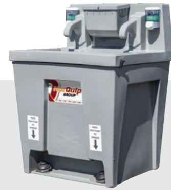
Hand Wash Stations Super Twin

Great for events where food is available or to encourage patrons to vacate the amenities faster. Our hands-free hand wash stations are operated easily using the foot pump.